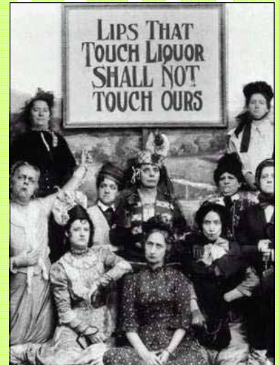
Early temperance Posters—women's protest above and below an early French Poster showing what happens to a Guinea Pig after drinking alcohol - standing up excited and then, boom, drops dead.

We assure the A of A that WCTU sends good wishes and support!